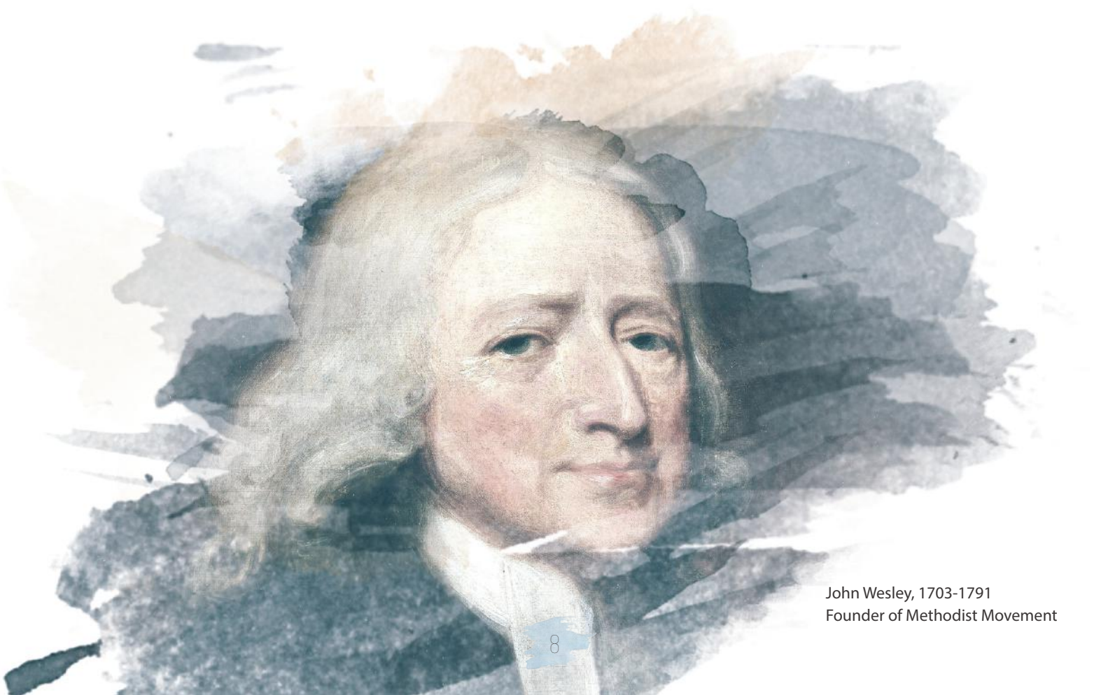
John Wesley, 1703-1791 Founder of Methodist Movement