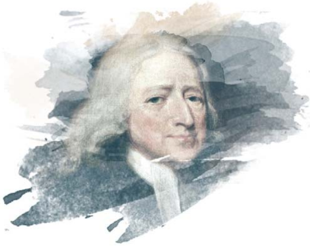
Yo h han. (John Wesley) A.D 1703-1791

Meh hta w di ^ aw. mo. hta. tan. kaw. pa.