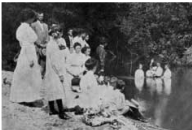
Baptismal photo of women from the Nazarene Rescue Home in Bethany, Oklahoma.

The primary function of the Board of Social Welfare and its antecedents was to publicize the various independent and semi-independent enterprises, rather than coordinate or encourage a tight system of denominationally-owned social welfare institutions. As the General Superintendents stated in 1923, "in a general way we have not accomplished a great deal in rescue work, that is, outside of the individual rescue homes located in different parts of the country. There has been no extensive plan executed throughout the connection."