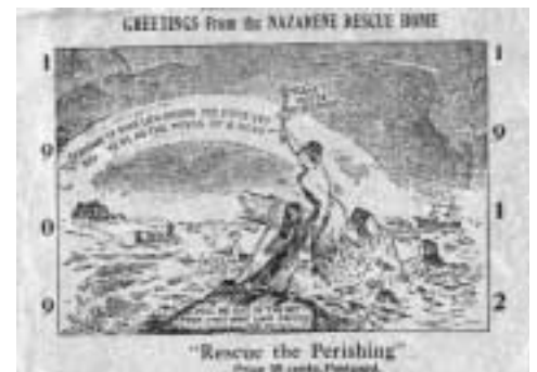
Cover of Nazarene Rescue Home booklet.