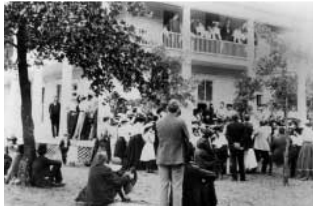
Berachah Industrial Home, taken during the dedication service, May 14, 1903.