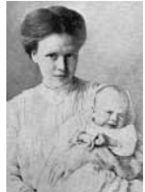
Woman and child from the Nazarene Rescue Home in Bethany, Oklahoma.