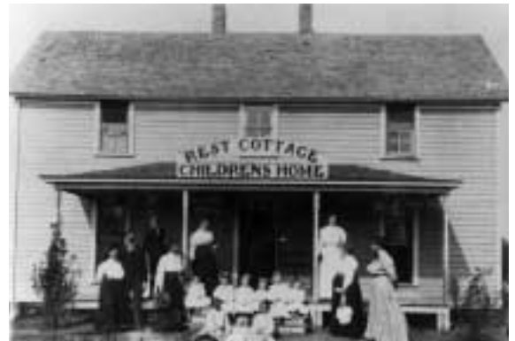
The Nazarene Rescue Home