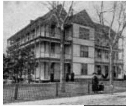
Wichita Rescue Home (above), and matron and infants in wheelbarrow from WRH (right).