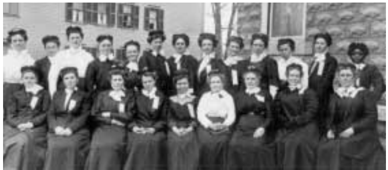
The ministry of deaconesses was only one of the many ways in which early Nazarenes expressed their commitment to compassion evangelism.