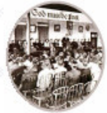
Chapel at Texas Holiness University (SNU), www.snu.edu