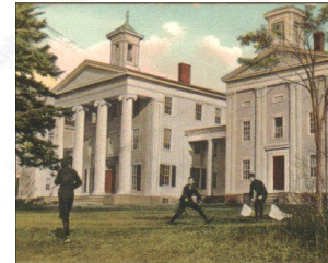
Pentecostal Collegiate Institute (ENC)

Today the challenge of Christian higher education remains invigorating as the denomination expands to every corner of the globe. Our educational institutions prepare pastors, missionaries, and laity to make an impact for Christ through evangelism, discipleship, and church planting. We are indeed preparing global Christians for serving in the 21st Century.