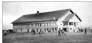
Northwest Nazarene College (NNU) Campus Hospital