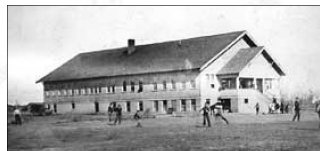
Northwest Nazarene College (NNU) Campus Hospital