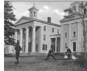
Pentecostal Collegiate Institute (ENC), *site not affiliated with www.nazarene.org

Today the challenge of Christian higher education remains invigorating as the denomination expands to every corner of the globe. Our educational institutions prepare pastors, missionaries, and laity to make an impact for Christ through evangelism, discipleship, and church planting. We are indeed preparing global Christians for serving in the 21st Century.