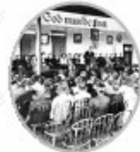
Chapel at Texas Holiness University (SNU), www.snu.edu