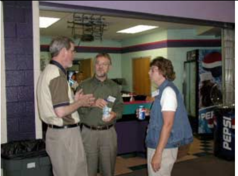
Discussing additional points.