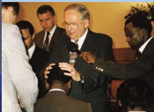
Ordaining pastors in Africa